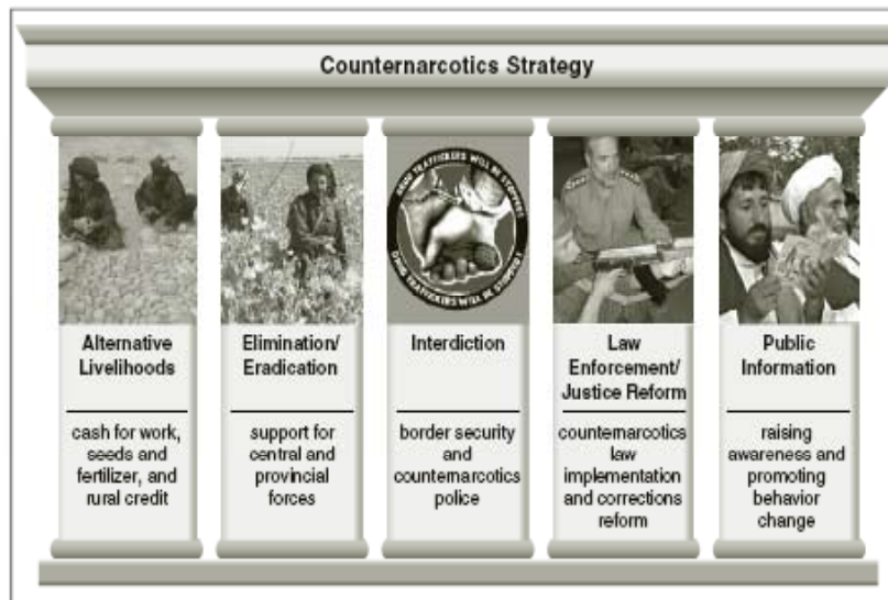
Figure 3. Five Pillars of the U.S. Counternarcotics Strategy. 49

Working with the UK and the Afghan government, the United States developed its own strategy to counter the opium problem in Afghanistan, which has the following five pillars: alternative livelihoods, elimination and eradication, interdiction, law enforcement and justice reform, and public information (see Figure 3). The Department of State (DoS), the U.S. Agency for International Development (USAID), the Department of Defense (DoD), and the Department of Justice (DoJ) are the primary organizations involved in carrying out this counternarcotics strategy.